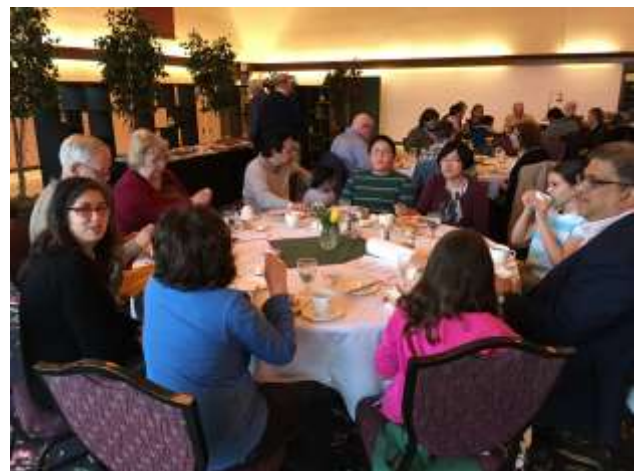
UUP members enjoy great food and company at the UUP End of the Year dinner.

Fill in information and then check your inbox for conformation email!