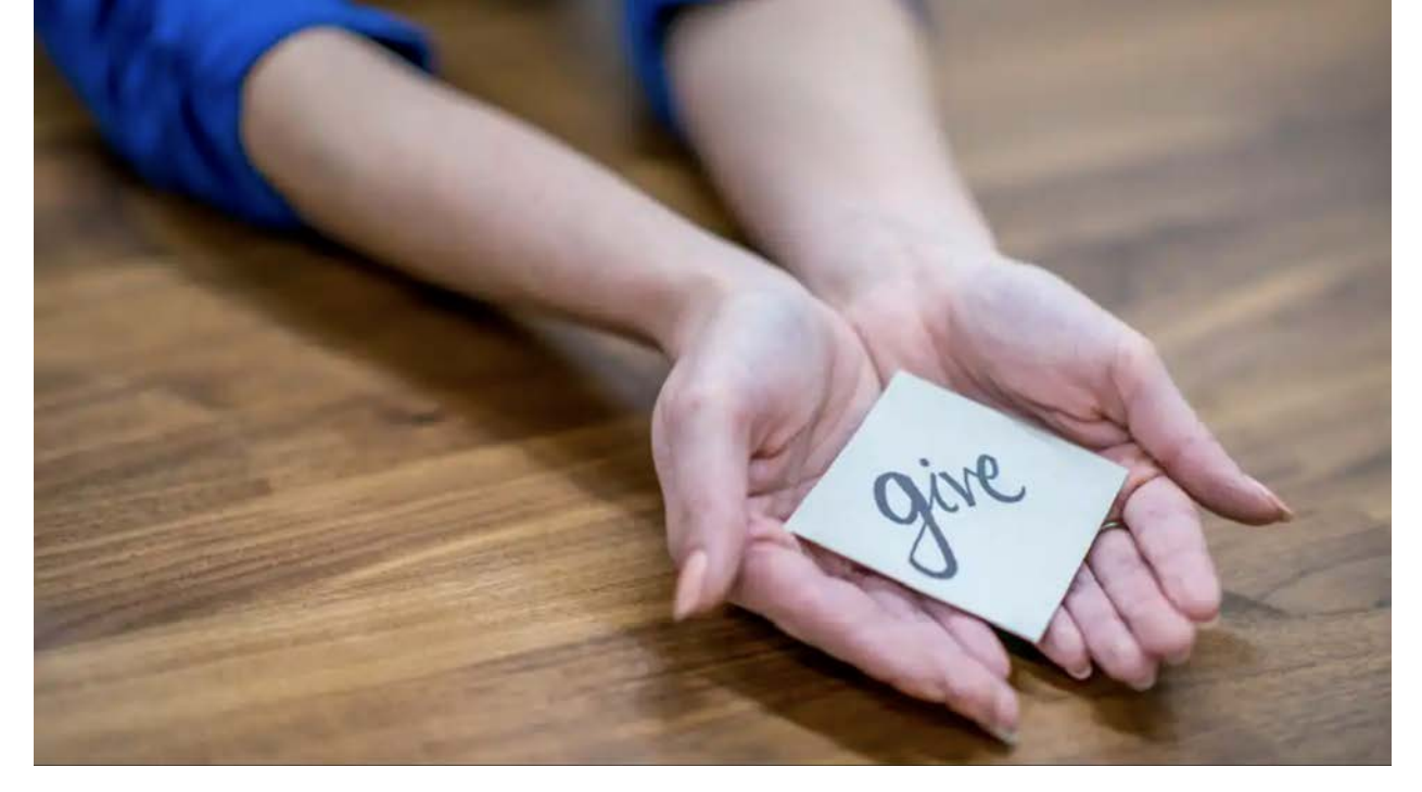
IMPORTANT: We currently have colleagues in need of Leave Donations!

If you earn vacation, you can help. Please note that the state only allows vacation leave credits be used in this program. In general, all UUP represented employees earn vacation, and can donate, except for Academic Year Academics.